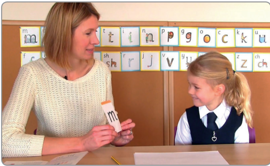
Learning the Speed Sounds in the classroom.