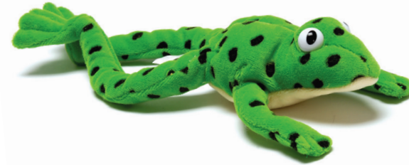
Fred says the sounds and children work out the word.

You can help your child to read words by following these steps: